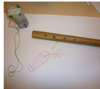
figure 1. A Device for Music Listening

Every child / group of children designed a product that was portable; it cannot be assumed that this was directly associated with the video clip as it is highly possible that the children would have made portable devices in any case but from other design sessions where we have not used the video clip it has seemed that sometimes the children have made larger objects. The children clearly made music making devices and in most cases the designs they made showed that they could be used to create music – some examples can be seen in figures 1, and 2. Some children created models of juke box style devices with radios and earphones and such like (see Figure 1). The video did not have earphones in it but it was apparent that the children could hear the music. Many children created instruments rather than devices, for example the flute shown in Figure 1 and instrument shown in Figure 2. What the children did not specifically include was any